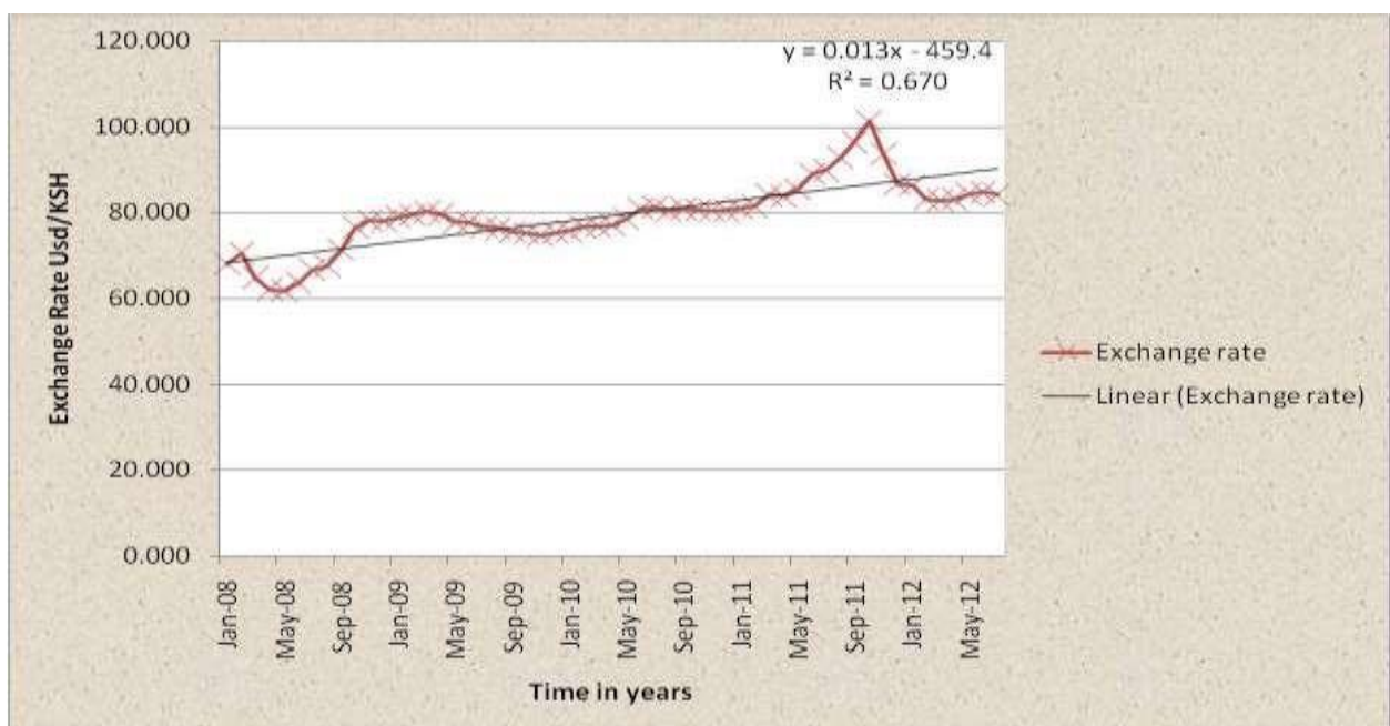
Figure 3: Graphical trend of exchange rate (USD/KSH)

Figure 3 presents the graphical trend of exchange rate (USD/KSH). The graph reveals that exchange rate have gradually increased over the time period. The trend has been consistent as indicated by the high R squared of 67%.