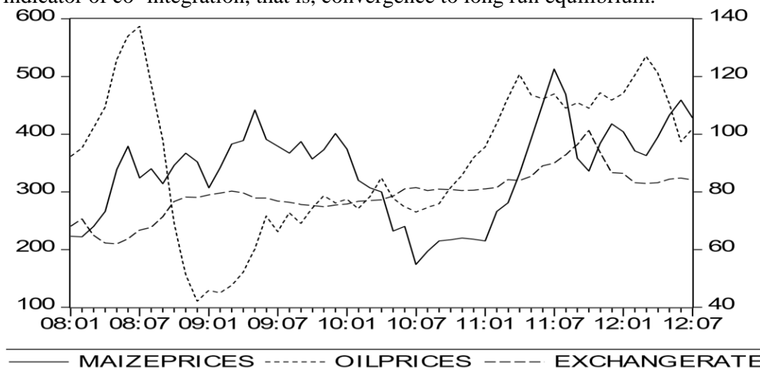
Figure 1: Grouped Trends

A group graph of the three variables is presented in figure 1. Results from eyeballing the trends indicate that there seems to be a relationship among the three trends. This perhaps is an indicator of co- integration, that is, convergence to long run equilibrium.