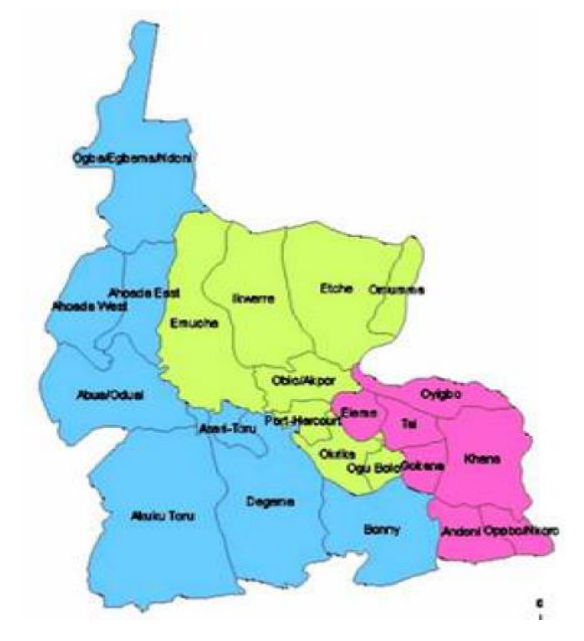
Figure 1: Rivers State Showing Local Government Areas and Headquarters